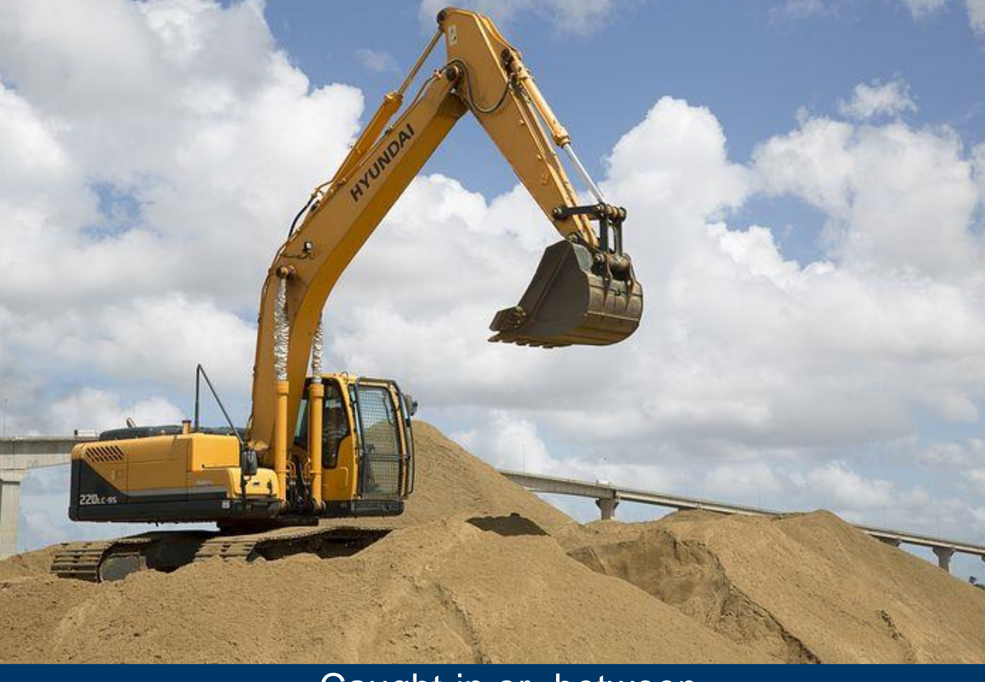
Caught-in or -between